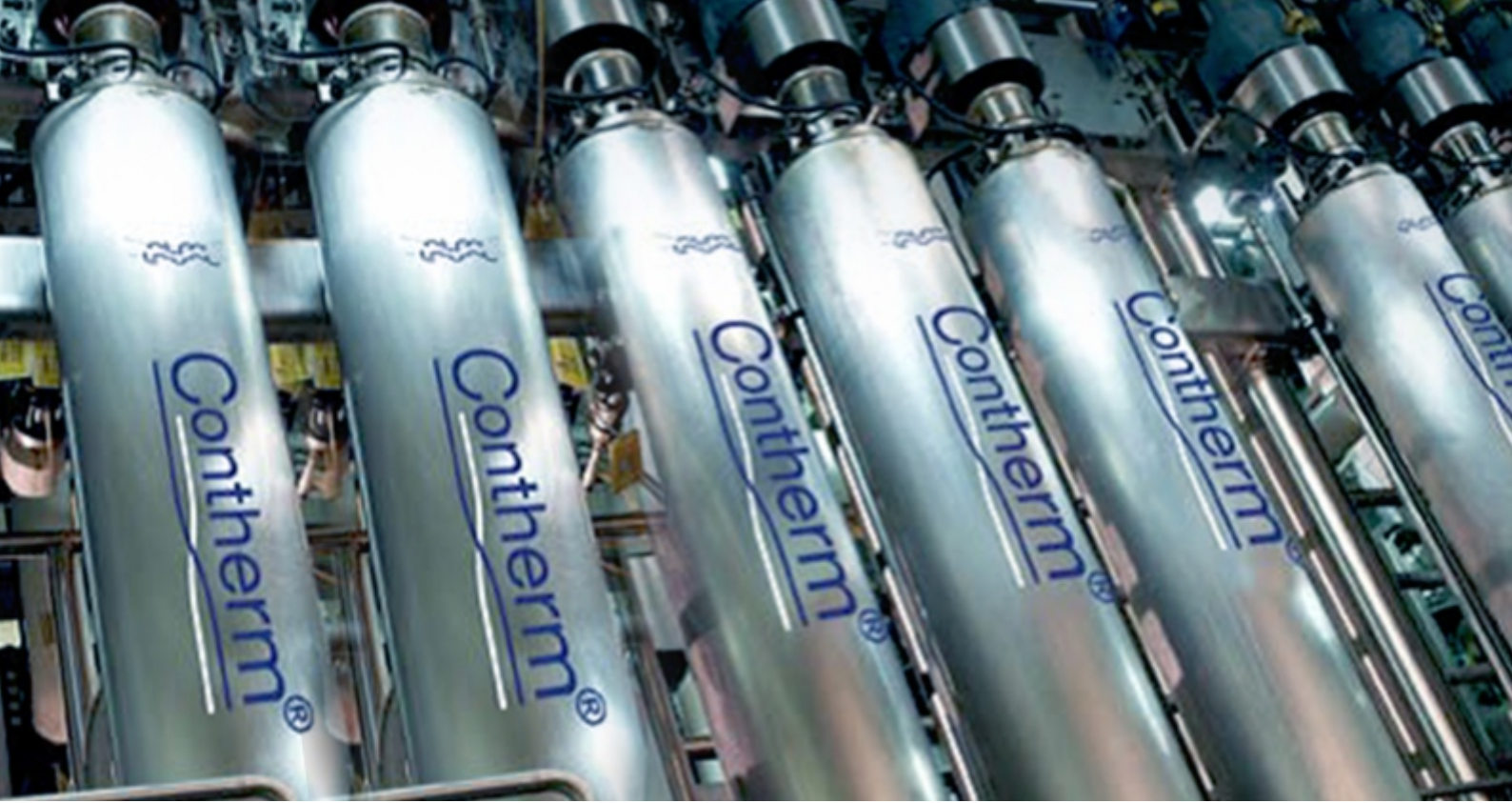
Contherm scraped-surface heat exchanger